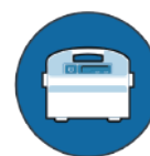
Indicator on Power Supply