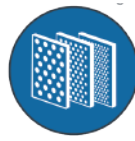
3 Filtration options