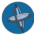
Gyroscopic Scanning System