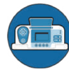
MMI - Interactive Digital Interface