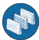
Filtration Option of 3 types